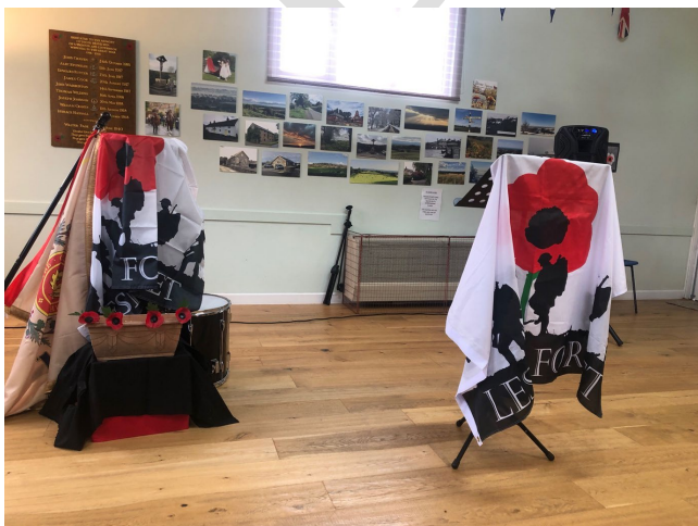
The scene is set