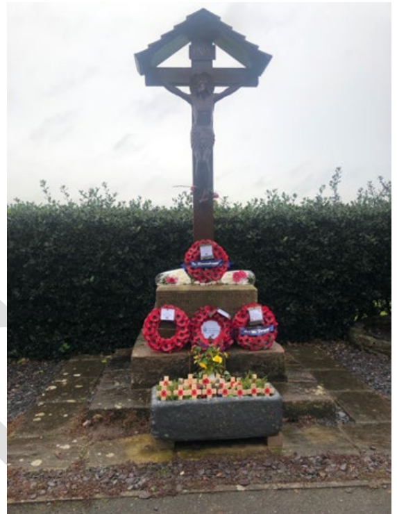
The wreaths and crosses after the event.