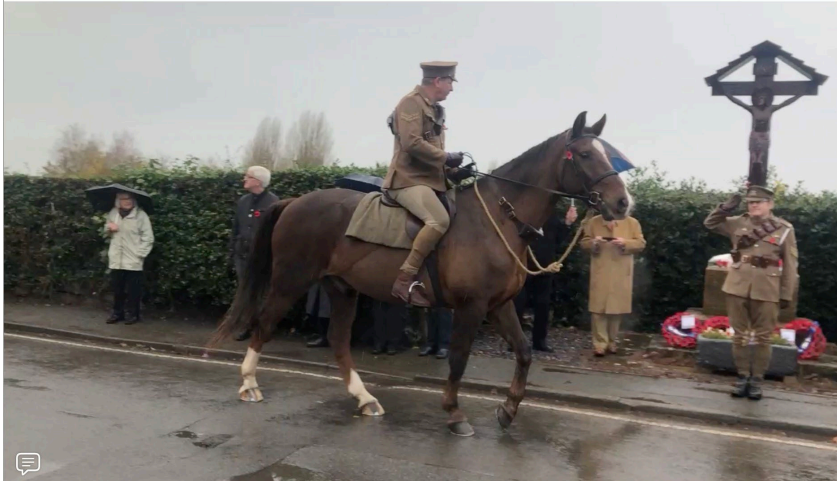
The Ride Past